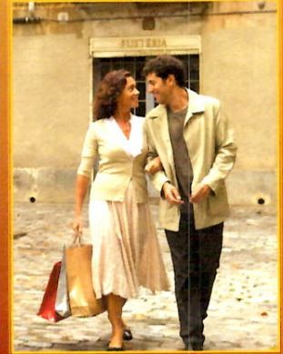
Photo ID and Key to the World Card as well as Cash and/or Credit Cards. Do you have your VIP cards?